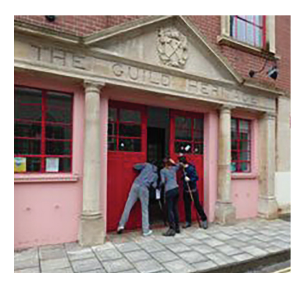
Film workshop participants peer through the door of The Guild Heritage building in Bristol

When one participant, who used a communication aid, joined the workshops we adapted how we created ideas and presented them. This flexibility and creativity benefitted the whole group, giving us more time to work on and share ideas in a group. These ideas were then captured on film and in note form.